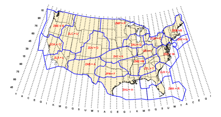
Figure 1. Current distribution of 1600 NRS waypoints and ARTCC regions (Borowski et al., 2004).

include both letters and numbers, NRS waypoints are not pronounceable as a single word but rather require the pronunciation of each character separately (e.g. KD54K is pronounced as kilo-delta-five-four-kilo).