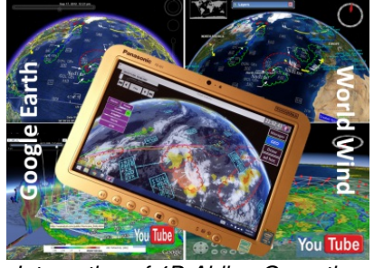
Integration of 4D Airline Operation Control Systems into NextGen and the NAS, Phase I