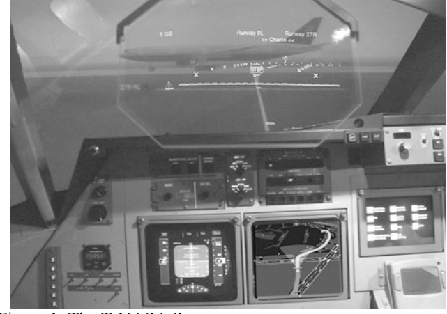
Figure 1. The T-NASA System.