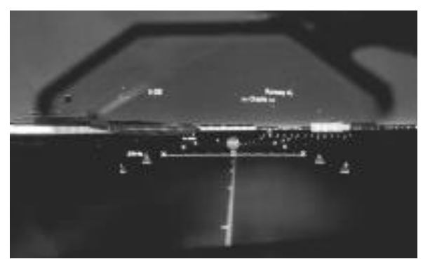
Figure 2. T-NASA HUD symbology

T-NASA HUD. Shown in Figure 2 below, the T-NASA HUD is available on the captain's side only, and presents scene-linked route guidance that directly overlays elements (taxiways, hold bars, etc.) that exist on the airport surface. Routing and guidance information are provided via the taxiway edge and centerline which display only the cleared taxiway route thereby providing both an overview of the route ahead and turn by turn guidance. Turn signs which indicate the location and sharpness of turns augment the guidance information. Control information, such as hold bars, is also portrayed in the HUD. The reader is directed to McCann et al (1998) for a more complete description of the T-NASA HUD.