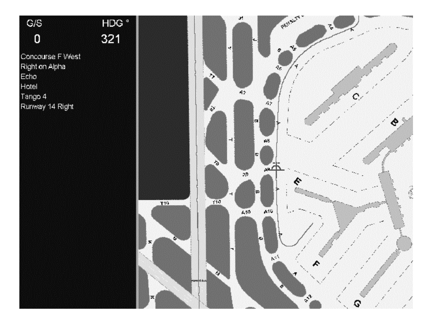
Figure 2: Electronic Moving Map, showing the ownship proceeding along the inner (Alpha) taxiway at Chicago O'Hare. The ownship is following a cleared route starting in the ramp area adjacent to Concourse F and finishing at departure runway 14R. Gray areas were green on map; the background in the left-hand clearance area and the route overlay line were blue.

combination of aids, were available to the pilot, all three displays were available to the experimenter. This allowed constant monitoring of the pilot's current location and progress. In addition, two-way communication between pilot and experimenter was available at all times via an intercom.