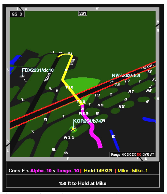
Figure 1. Electronic Moving Map (EMM)

view. Thus, the EMM can lead to superior taxi performance, but its design also encourages a head-