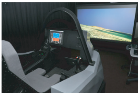
Current Part-Task Simulator

Impact Our work on OBVA will help the Air Force leadership raise, lower or retain current visual standards based on the knowledge of how people meeting those standards will perform visually in an operational setting. It can also be used to determine the effects of refractive surgery, pharmaceuticals, and other future technologies on vision performance. The net result will be more effective and safer operations.