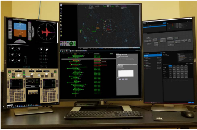
Fig. 1. The NASA RCO GCS. From left to right: aircraft instruments, traffic situation display (center-top), aircraft control list (center-bottom), and the R-HATS Agent.