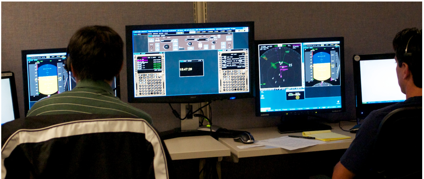
Figure 1. Dual pilot station.

together for the duration of their participation. The simulation ran from August 16-27, 2010 with individual participants running in one of the two weeks. Due to unexpected events, a first officer from the second week dropped out part way through the simulation and was substituted by a captain from the first week. All pilots and controllers were compensated for their participation.