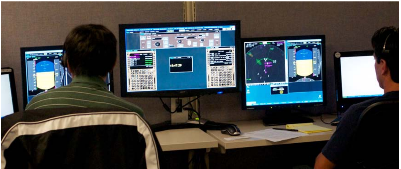
Figure 1. Dual pilot station.

together for the duration of their participation. The simulation ran from August 16-27, 2010 with individual participants running in one of the two weeks. Due to unexpected events, a first officer from the second week dropped out part way through the simulation and was substituted by a captain from the first week. All pilots and controllers were compensated for their participation.